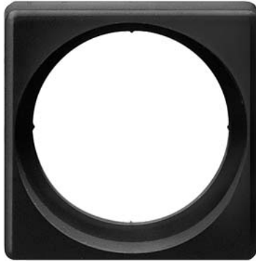
cornice singola per design quadrato