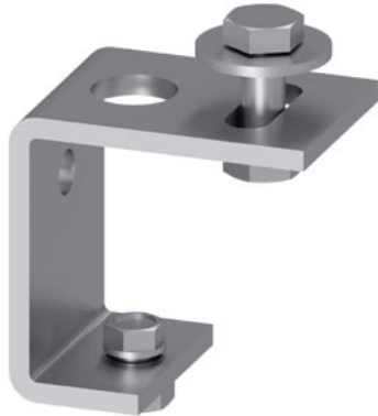
ALPHA Universal quadro modulare supporto per sbarra PEN