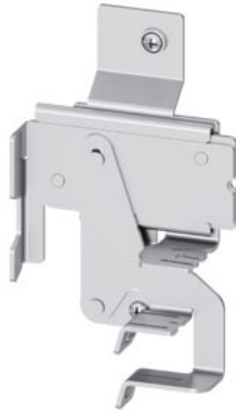
Bowden cable interlocking for handle, accessory for: 3VA55; 3VA65/66