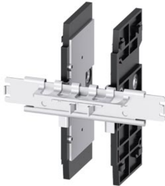
barra scorrevole di interblocco accessori per: 3VA12