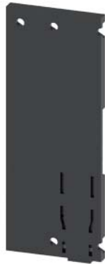
adattatore per guide DIN accessori per: 3VA11 2P