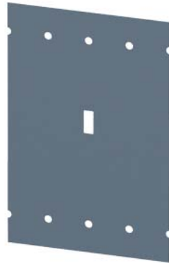
piastra d'isolamento DC accessori per: 3VA10/11 4P