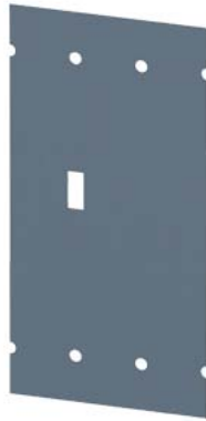
piastra d'isolamento DC accessori per: 3VA10/11 3P