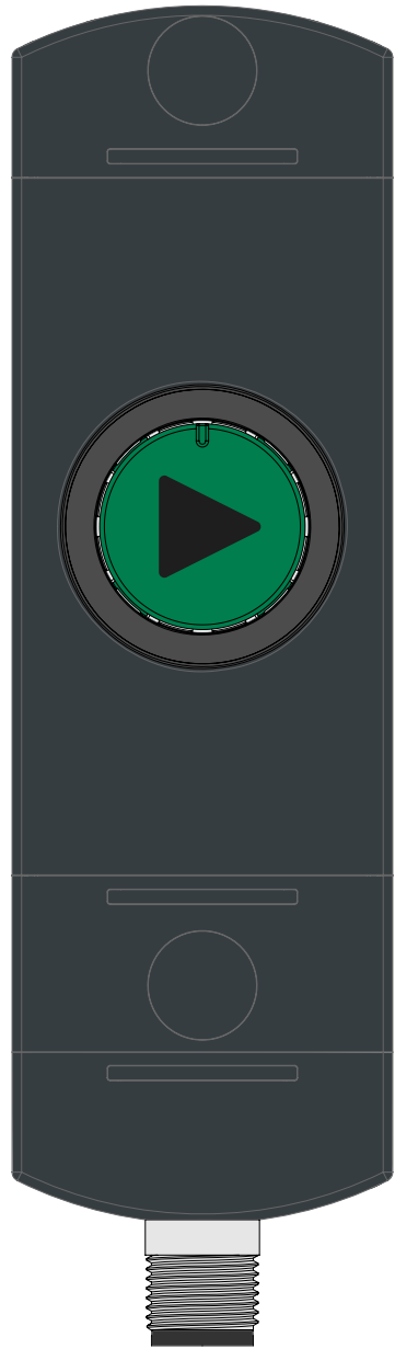
Illuminated button spring-return