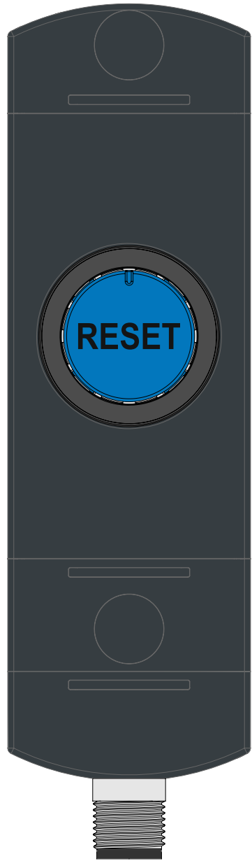
Illuminated button spring-return