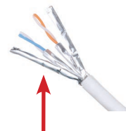
Foil shield in cable prevents unwanted alien crosstalk