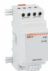
Expansion modules for modular products - communication port EXM1012