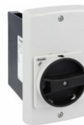
Flush mount enclosures IP65 for SM1R (UL type 4X) SM1Z Flush mount enclosures IP65 for SM1R (UL type 4X) SM1R...