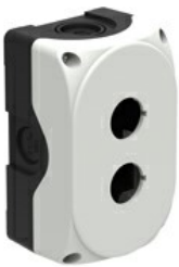
Plastic control station without actuators - for 2 actuators LPZP2A8