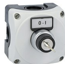
Grey control station LPZP1A8 complete with key selector lpcs320 1NO+1NC and label holder with label "o-i" LPZP1B8302