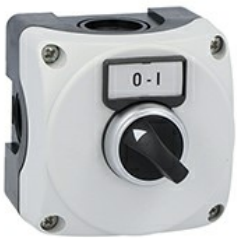
Grey control station LPZP1A8 complete with lever selector lpcs120 1NO and label holder with label "o-i" LPZP1B8300