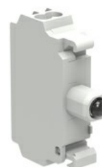
LED elements steady light with spring-clamp terminals LPXLP