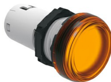
LED integrated monoblock pilot lights steady light LPML