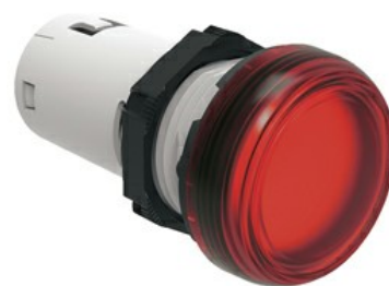
LED integrated monoblock pilot lights steady light LPML