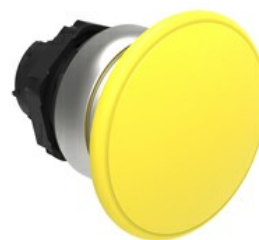
Mushroom head pushbutton, spring return Ø 40mm/1.6" LPCB614