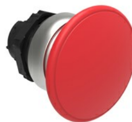
Mushroom head pushbutton, spring return Ø 40mm/1.6" LPCB614