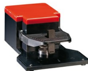
One pedal, with safety lever - open KG110