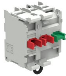
Contact elements - without mounting adapter LPXC