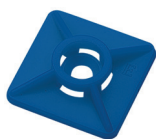
PA 6.6 DT