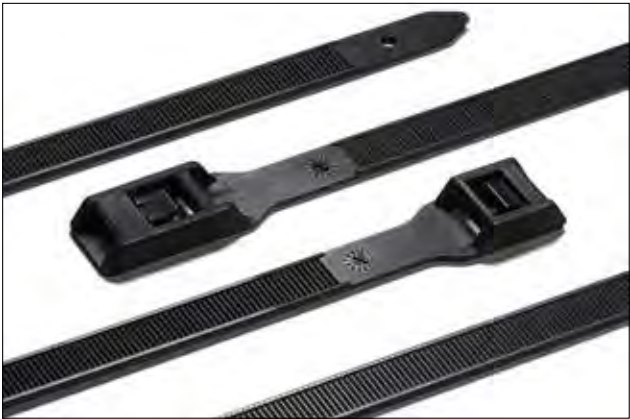
Low profile cable ties, RPE- and PE-Series.