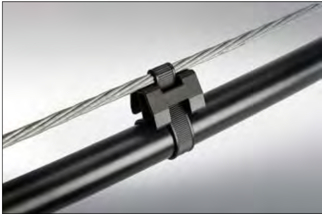
Spacer ties enables proper row-to-row cable management above the ground.