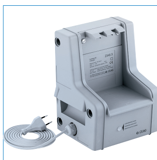
Charging unit Z 345.3